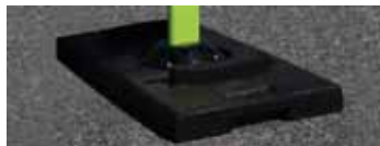
Portable Rubber Base