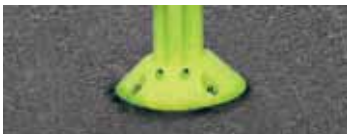
Surface Mount Base

Pedestrian Crosswalk Indicators kits come with a surface mount base for fixed applications where the post and sign will remain on the surface for an extended period of time. Available upon request is a portable rubber base which is engineered for demanding applications because it has the weight to support the larger crosswalk signs. An added convenience of this base is the recessed handle, making transport easy.